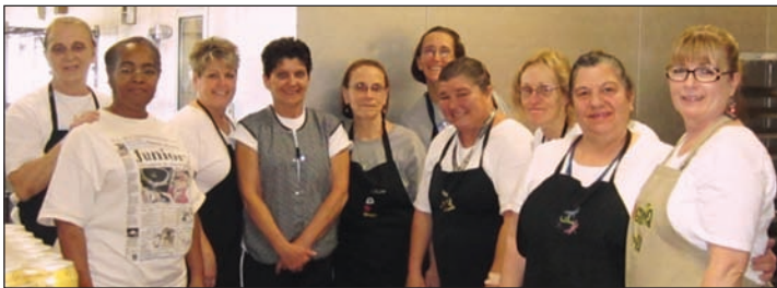
Valley Central Teachers Association honors food service workers on SRP Recognition Day.