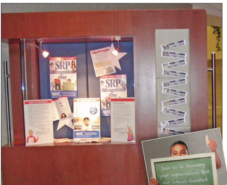
At NYSUT headquarters, a kiosk promotes ways to celebrate School-Related Professionals, as part of the "SRPs Make a Difference" campaign.