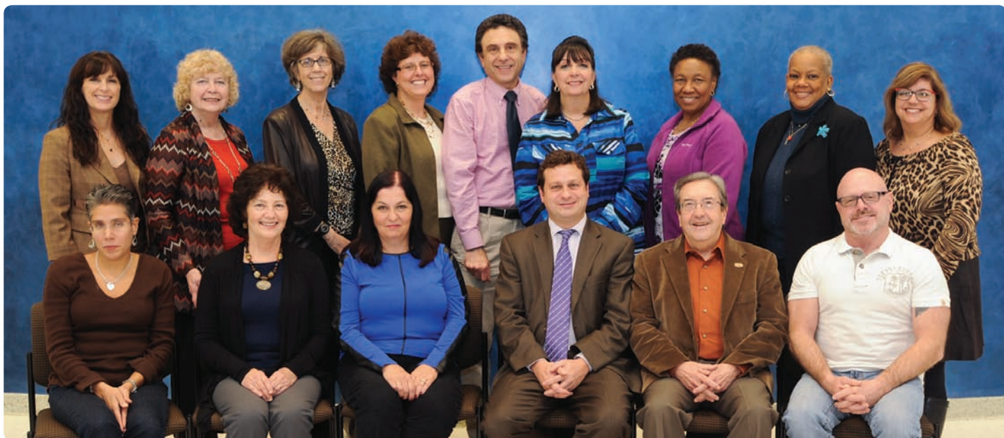
All members not shown

The NYSUT Health Care Professionals Council advocates for the union's more than 15,000 health care professionals. The council represents members who are registered nurses, licensed practical nurses, certified nursing assistants, clinical instructors, psychologists, guidance counselors, school counselors, physical therapists, occupational therapists, speech therapists, physicians, pharmacists and lab technicians. These professionals are employed in public and private sector schools, hospitals, universities, visiting nurse associations, private practice and residential and day treatment facilities.