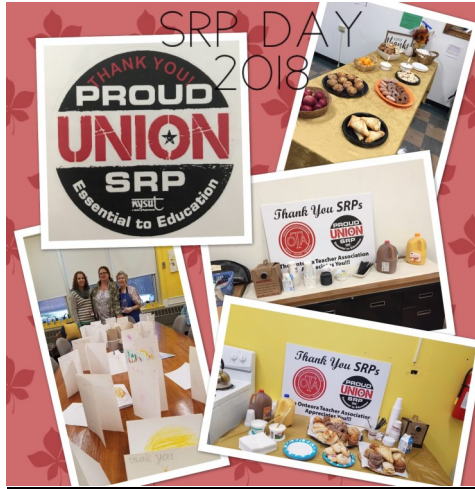
Onteora TA hosted breakfast for Onteora NTEA members in seven district buildings.