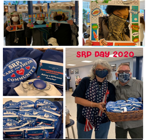
Photos: (Above) Half Hollow Hills TA celebration; (below) Onteora TA celebration.