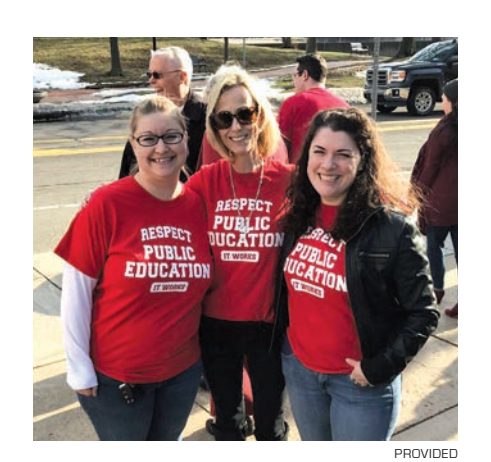
Whose schools? OUR schools! SenOMara-support public ed! #DeVosTATION @nysut. Tweet by Dora Leland, Horseheads TA.

An increase of $1 billion in school aid, which includes an increase of $700 million in Foundation Aid and fully funds expense-based aid.