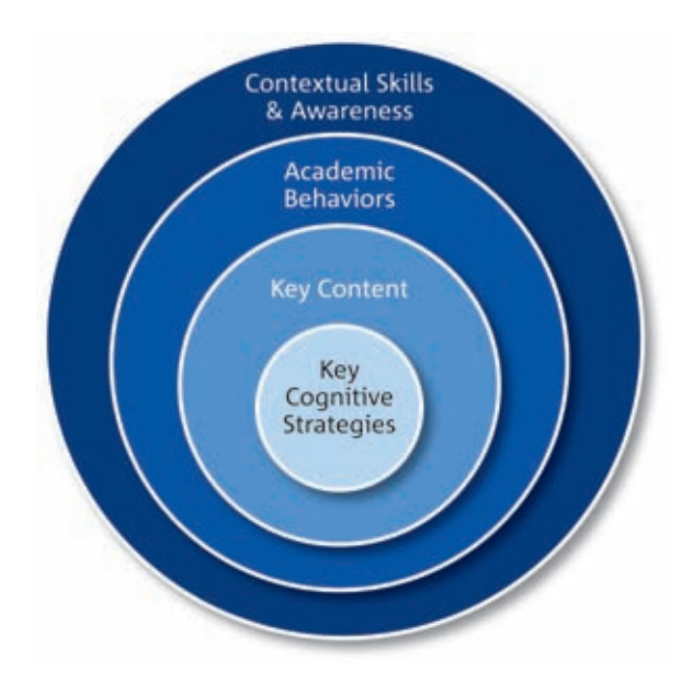
Figure 1: Facets of College Readiness

What the model argues for is a more comprehensive look at what it means to be college-ready, a perspective that emphasizes the interconnectedness of all of the facets contained in the model. This is the key point of this definition, that all facets of college readiness must be identified and eventually measured if more students are to be made college-ready.