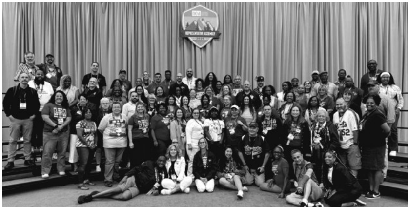
NYSUT Delegates to NEA RA 2025