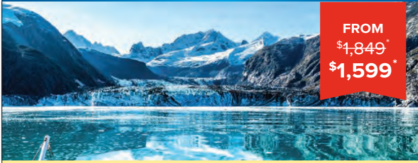
FREE ONBOARD CREDIT