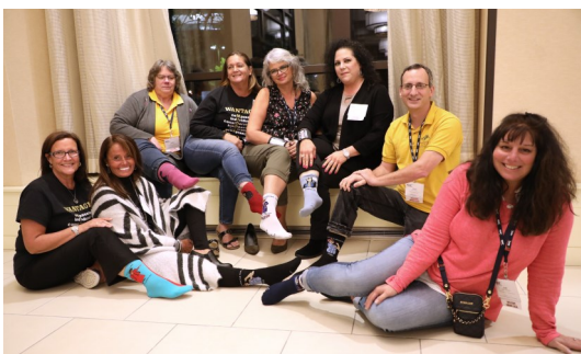
Members of the Saratoga Adirondack BOCES Employees Association show off their labor-themed socks.

Save the dates! The 2021 SRP Leadership Conference will be held Oct. 29–31, in Saratoga Springs.