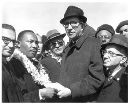
Former AFT President Al Shanker meets Martin Luther King Jr.