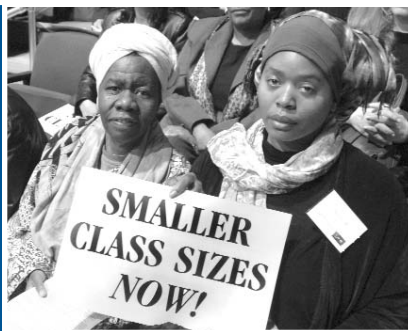
NYSUT supporters attend a rally.