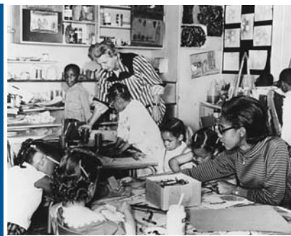
Throughout its history, NYSUT has advocated for strong urban schools.