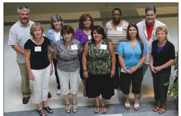
The newest ELT SRP instructors.

We invite you to check out the pictures from the training on Flickr at www.flickr.com/photos/nysut/sets/ .